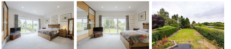
Bedroom one 17'8" x 12'1" (5.40 x 3.70)